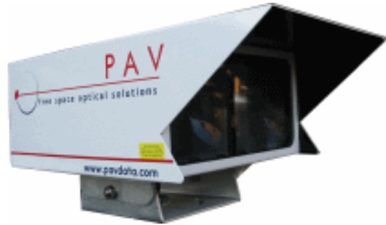
Figure 2: Images of the PAVData 10Mbit/s IR Laser System